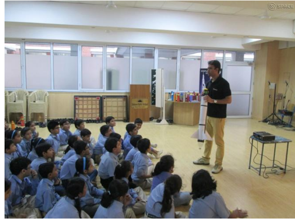
Students learnt why only rocket can go into space