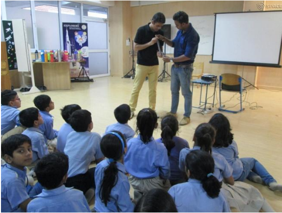
Students learnt how to construct a rocket