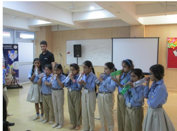
Students learnt how air occupy space with the help of “Who can blow the balloon” activity