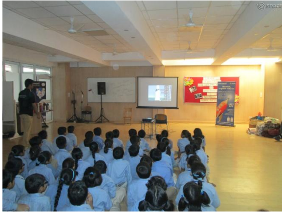
Students learnt about rocket principle