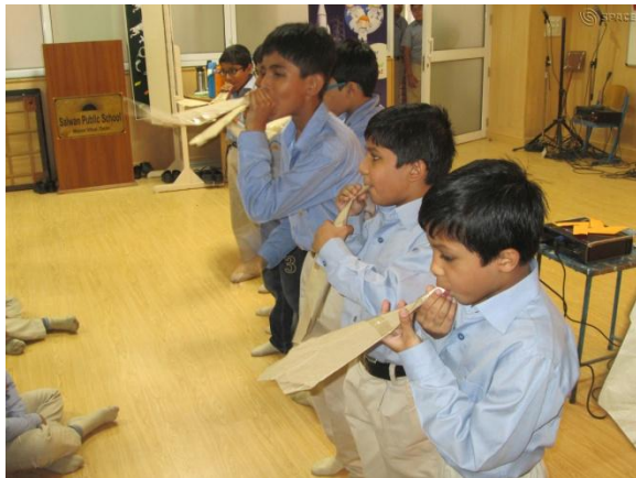
Students learnt about air movement from high pressure to low pressure with the help of “Who’s got the lung power” activity