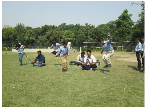
Students launched their rockets