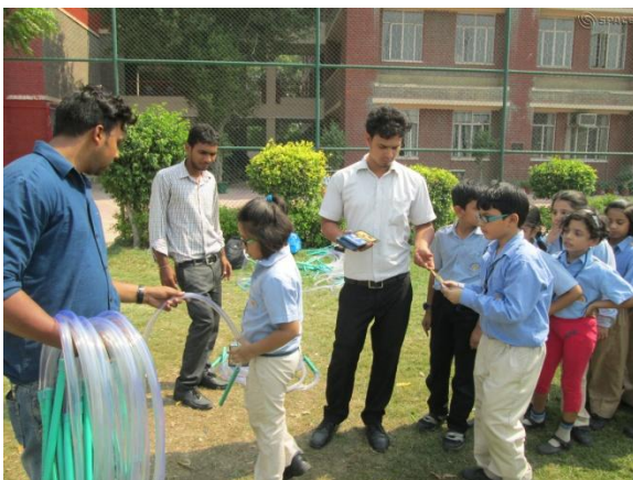
Students received kit