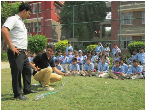
Students learnt how to launch the rocket