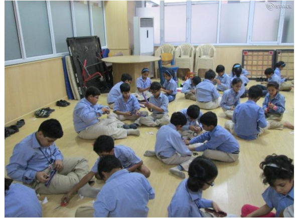
Students constructed their rockets